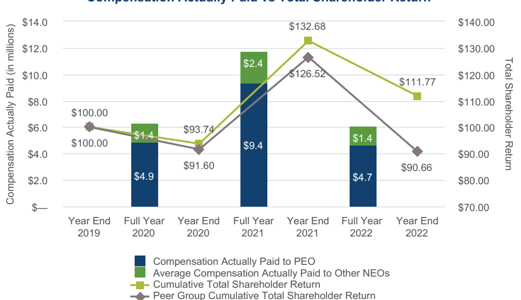
Compensation Actually Paid vs Total Shareholder Return

The following chart reflects the relationship between our NEO compensation actually paid, calculated in accordance with with Item 402(v) of Regulation S-K, versus the performance of Rayonier's common shares (assuming reinvestment of dividends). The chart also compares the performance of Rayonier's common shares with that of the FTSE NAREIT All Equity REIT Index.